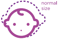
Small Head Size