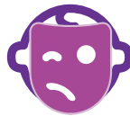
Abnormal Facial Features